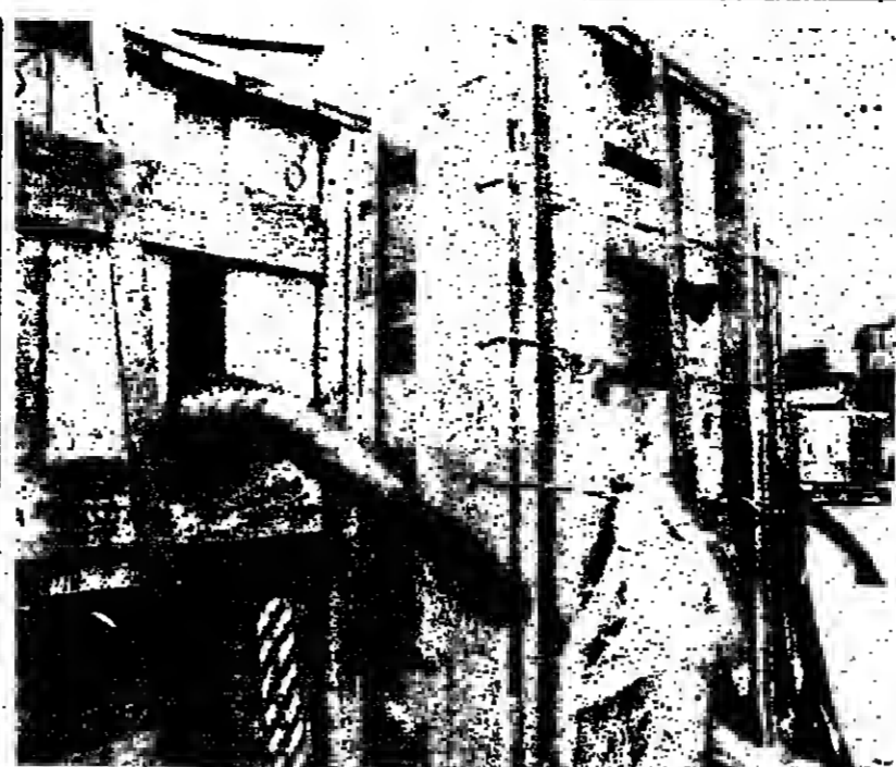
The trunks of 15 baby elephants inside their air shipping crates sniff around as they stand on the tarmac at Frankfurt International Airport yesterday.